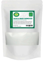
Brewing Supplement Head and Body 1 kg